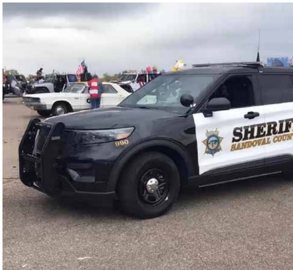
(sandoval county sheriff dept)