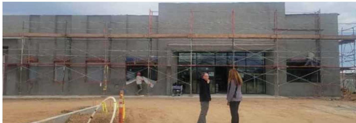
New Rio Rancho location of Olive Tree Compounding

“It really does start with the client being sensitive and in tune with who