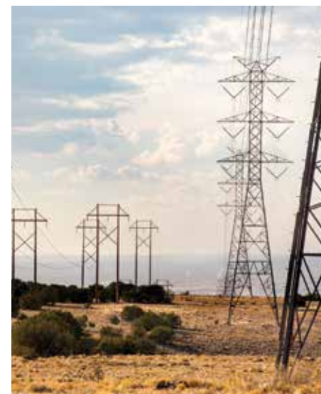
Three energy transmission lines in the Bureau of Land Management Buffalo Tract march westward toward the Rio Grande valley.

Las Placitas Association report is a monthly report from the nonprofit organization in Placitas that works to protect open space, restore riparian watersheds, and promote recreational, educational and rural activities.