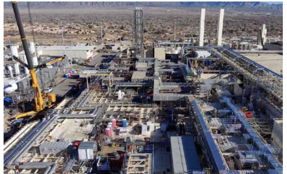
A crane looms over construction at the Rio Rancho Intel campus, Jan. 2024

The county's employment data is based on information reported by employers, covering 97% of nonfarm wage and salary workers.