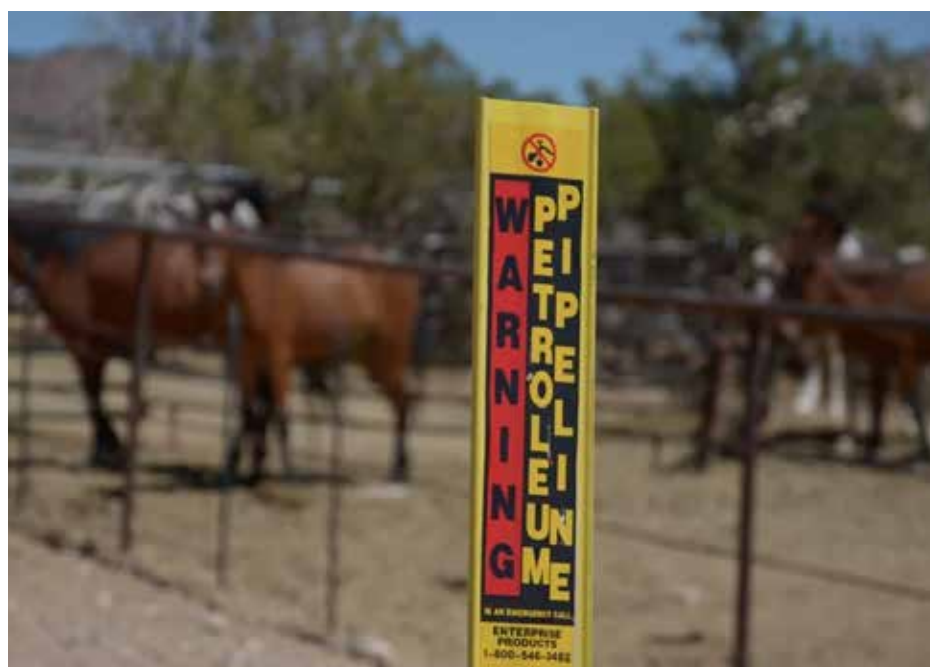
Tex-New Mex pipeline signs in Placitas.