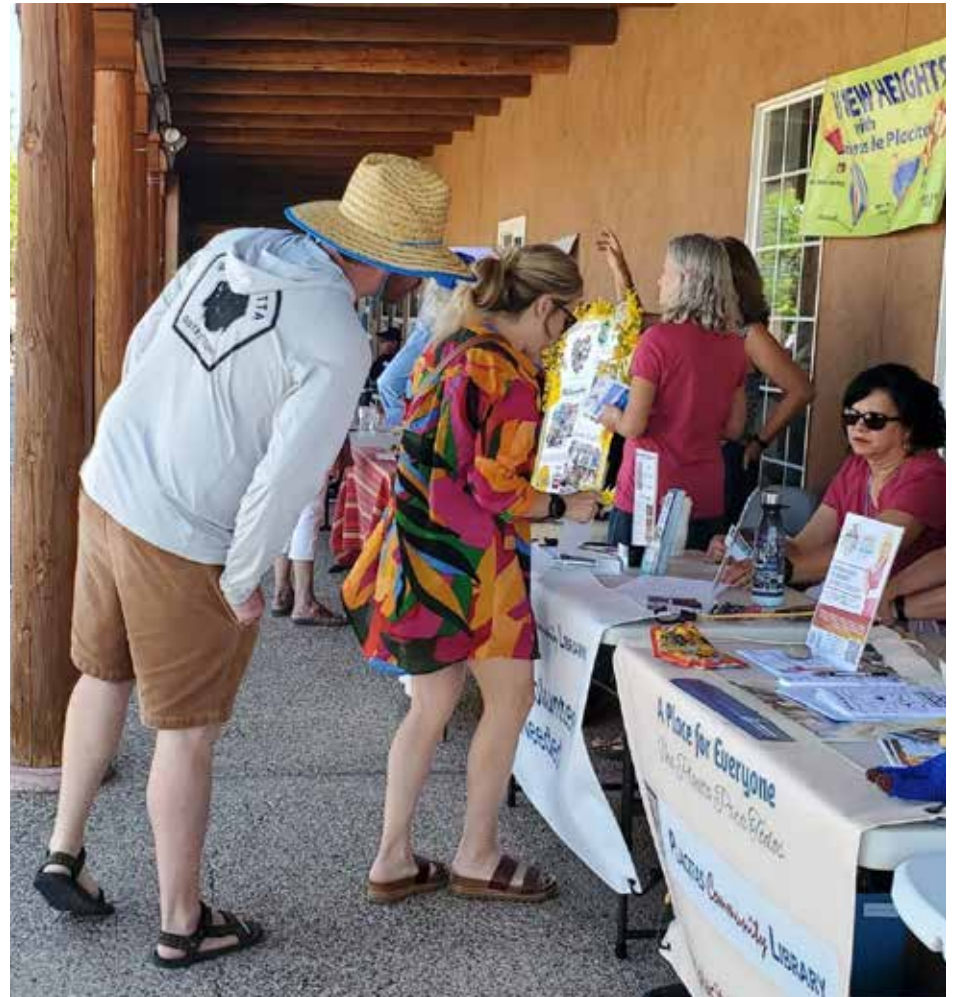
Crowds visit vendors at Placitas Appreciation Day.

For more information on the Placitas Chamber of Commerce, visit Placitaschamber.com or call (505) 867-7471.