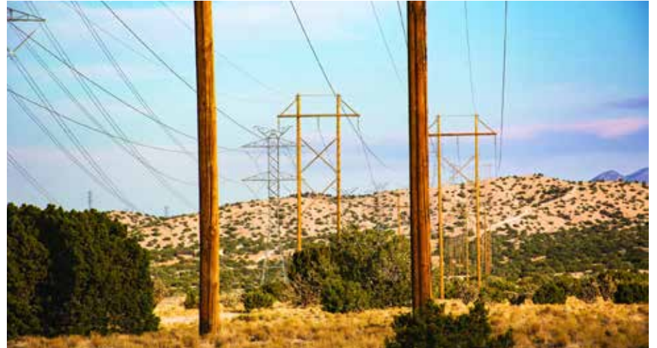
Wooden poles support two energy transmission lines while steel towers support the third in this view to the east through the the Bureau of Land Management Buffalo Tract in Placitas.

Sacred Places: Honoring Chacoan Culture. LPA sponsored an artists' adventure in Chaco Canyon in late 2023 that will culminate in an exhibit at Placitas Community Library in July 2024. The exhibition will feature works inspired by that trip and is open to artists similarly inspired. While Chacoan Culture was centered within the canyon, Chacoan influence extended much farther, through the San Juan Basin and beyond. We encourage you to explore the outliers as well and submit your work for this exhibit. The call for art is now available at placitaslibrary.com/programs/art-exhibits/call-for-artists