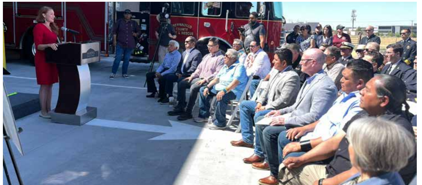
U.S. Rep. Melanie Stansbury joined Gov. Michelle Lujan Grisham (seated bottom right) and leaders from Sandia Pueblo and Sandoval and Bernalillo counties.

Since it relied on these three disparate agencies, the pueblo could not regulate the quality of service needed.