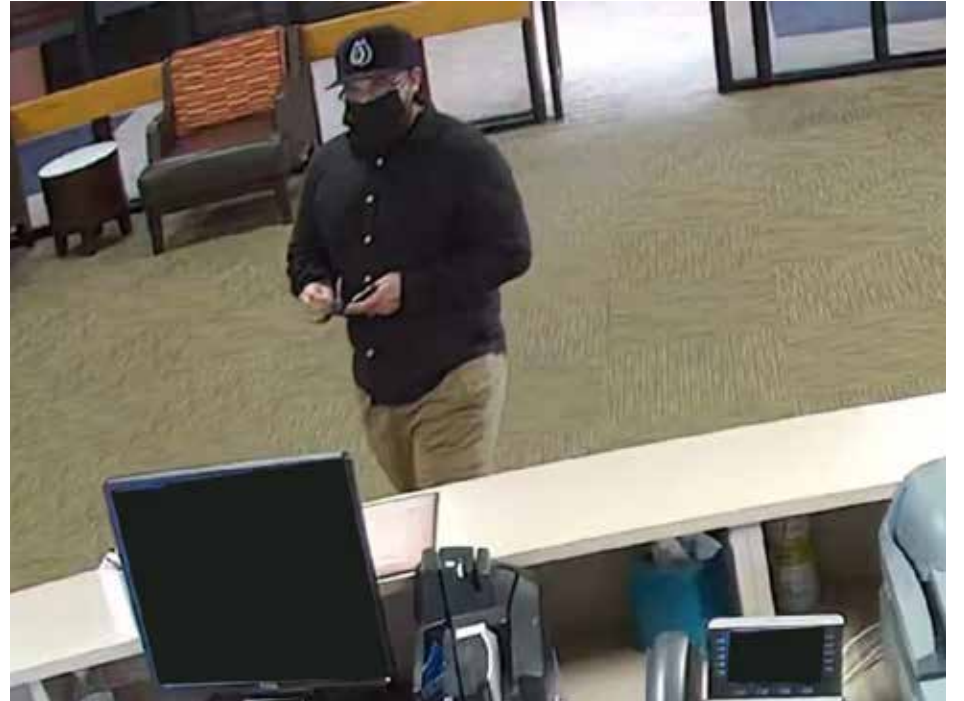
Tan Pants Bandit.