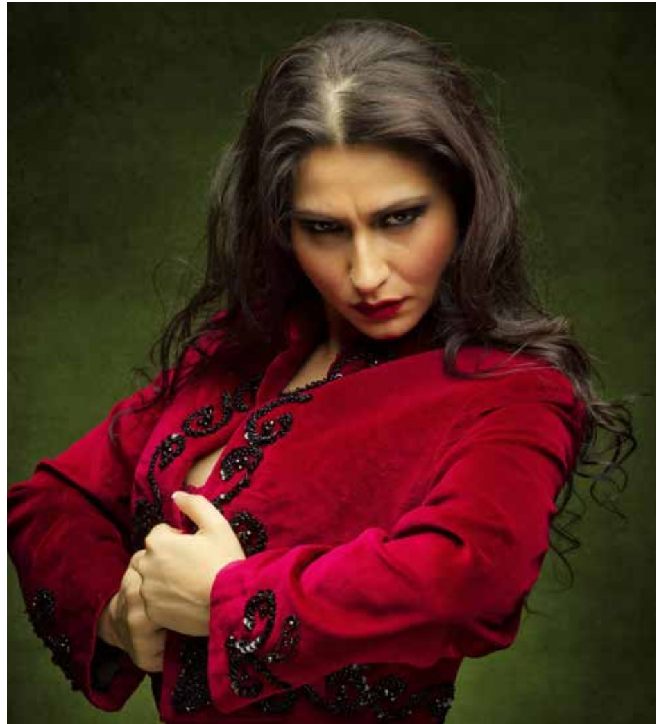
Flamenco performer Karime Amaya.

Full schedule, VIP packages, workshop info and more at ffabq.org .