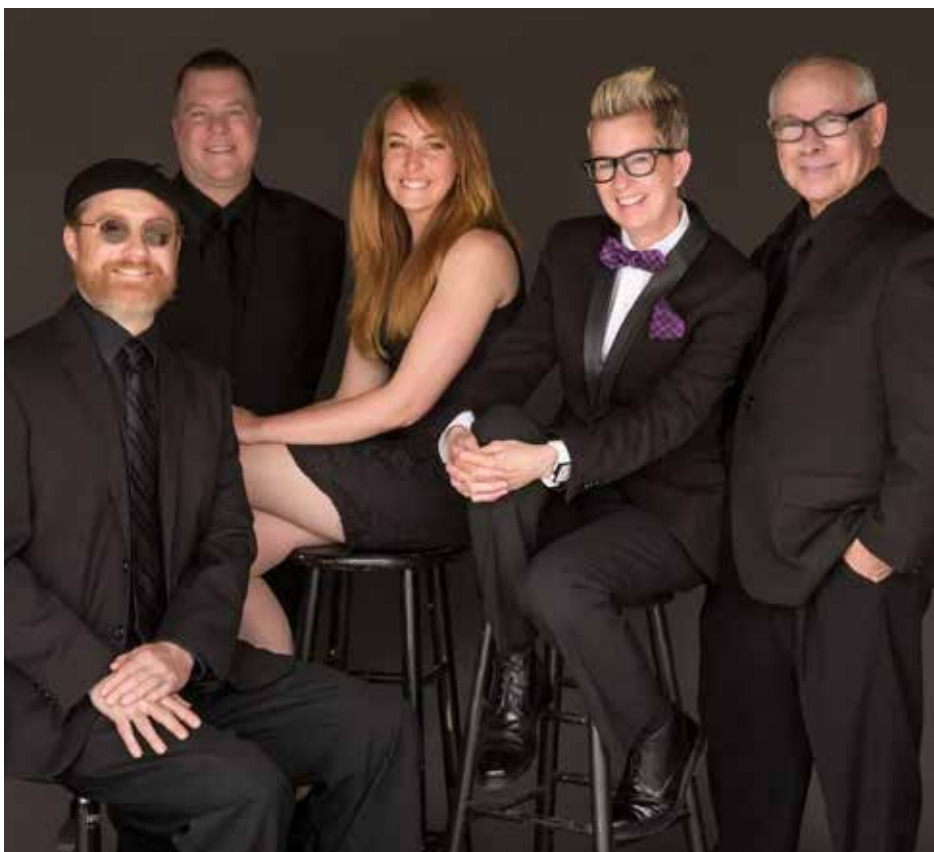
Entourage Jazz.

Tickets can be purchased online at my.nmculture.org/20943/32486 .