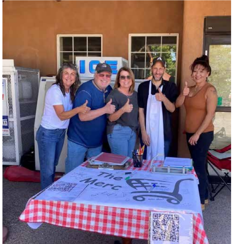
The Merc in Placitas gets new life and new co-owners.

As The Merc's owners gear up for the grand reopening, although the date remains unconfirmed, they're inviting everyone to visit their Facebook page. There, interested individuals can submit pre-employment screening forms and request product information.