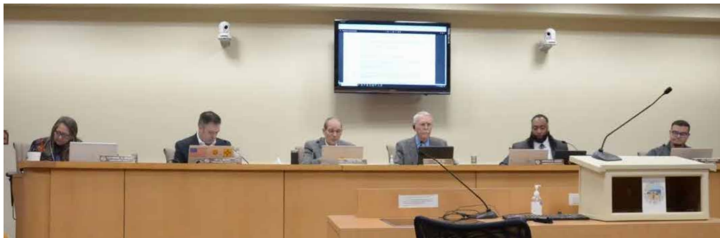
Sandoval County Commission.

Problem properties ordered to remove rubbish and debris